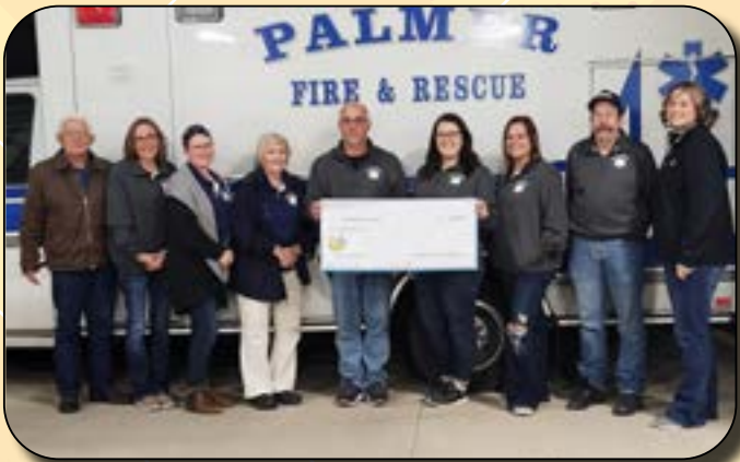
Palmer Rescue Squad