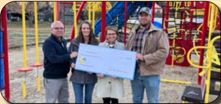
SID #2 Idlewilde