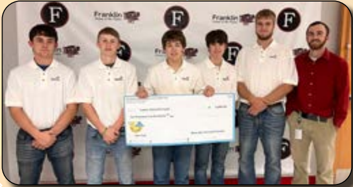
Franklin SKILLS USA