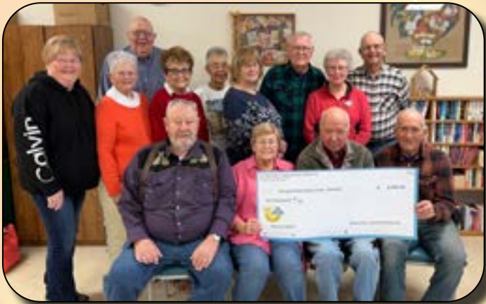
Young at Heart Senior Center - Bertrand